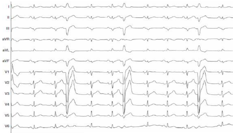
Figure 1. Twelve-lead ECG. Sinus rhythm and short coupling atrial ectopies (with functional left bundle branch block [LBBB])