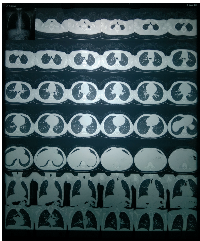
Figure 2. High-resolution computed tomography of chest: normal study