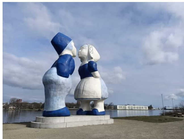
The Delft Blue Kissing Couple XXXL, Hemponplein, The Nothern Sea Canal, Amsterdam, The Netherlands. Jonathan Lipton, February 2021. Tasmania, Australia.

(The statue was built in 2017 along Bicycle route to stimulate people to come to the area bicycle. Statue was made in collaboration by Saske van der Eerden, ArchitecturePlus and Van Zuilen Construction Advice. )