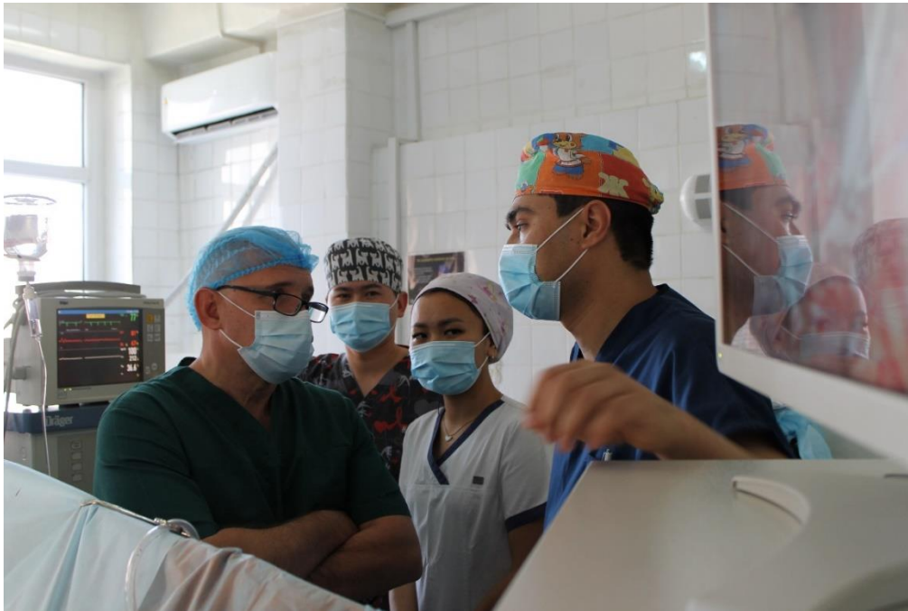
c) Figure 2. Joint master-class cardiac surgery operations by Ukrainian, Kazakhstan and Kyrgyzstan surgeons

Important, actual and emergent directions of the development of cardiac surgery fields as mini-invasive cardiac surgery and surgery of chronic heart failure