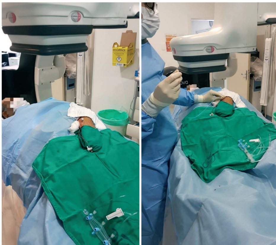
Figure 1. Position of the patient's arm during examination performed by the distal radial route

To perform the procedures in interventional cardiology through the transfemoral route, it is important to puncture the vessel in the middle of the common femoral artery, above the bifurcation of the femoral artery in superficial and deep, and 2-3 cm below the inguinal ligament.