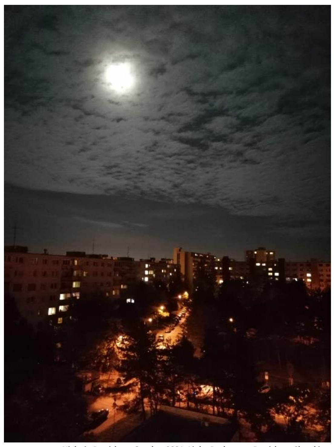
Night in Bratislava, October 2021. Ljuba Bacharova, Bratislava, Slovakia