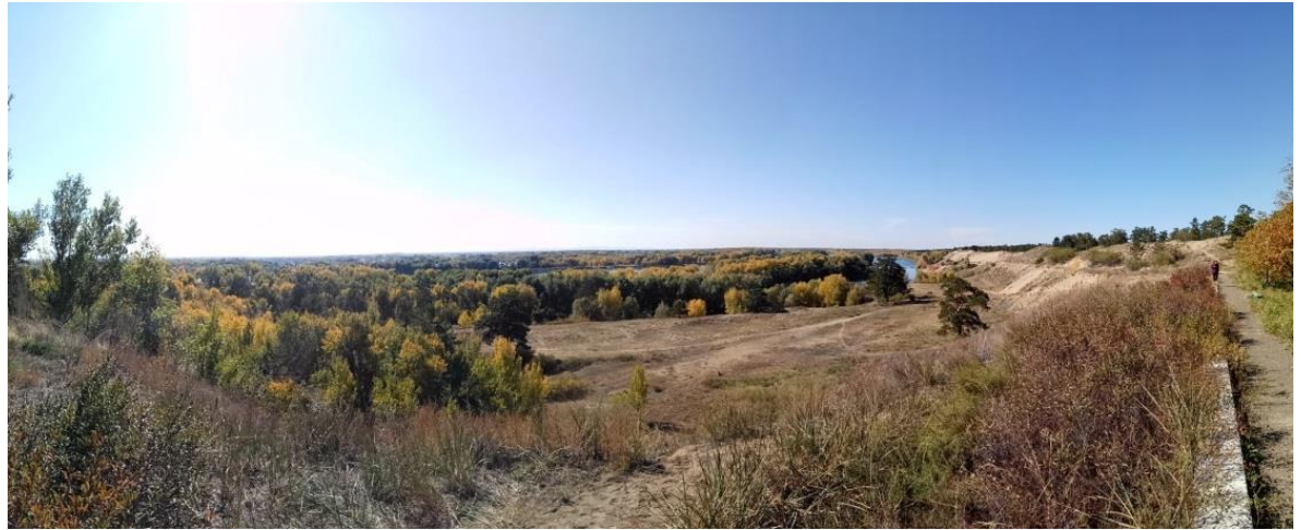
Figure 7. Enjoying nature during brief breaks between workshops