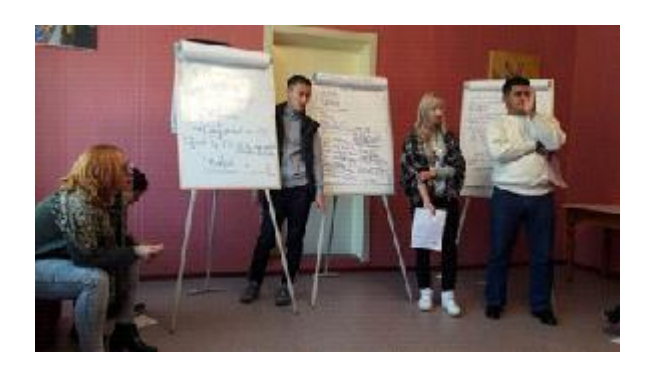
Figure 1. Panel discussion

Participants were divided into 3 research groups in order to obtain diversity in background, experience and nationality of the team members. During 4 days of workshops they prepared and presented the following projects: