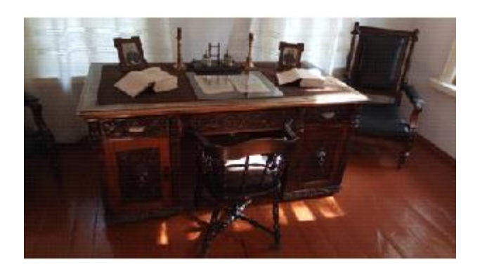
Figure 5. Cultural program: Polkovnichy Island, monument "Stronger than Death" and "Peace" stella in memory of the victims of the Semipalatinsk Nuclear Test Site and Museum of Fedor M. Dostoyevsky

The participants and faculty visited the Semey State Medical University: an educational and clinical center where students are trained using high-tech interactive patient simulation and medical mannequins, virtual reality surgical training simulators, models used in the educational process. The guests were given the opportunity to listen to the heart sounds on the cardio-pulmonary simulator patient training simulator