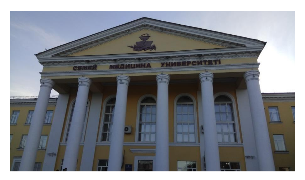
Figure 6. Semei Medical State University(upper picture)

Although the schedule was tense, and the teams worked from early morning until late at night, participants and teachers still had the opportunity