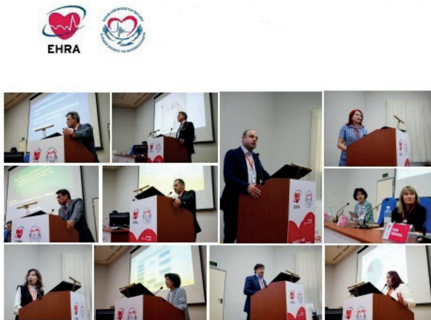
Figure 1. Twenty-three international speakers gave 27 presentations during course

and other countries (Fig. 1). The specialists of the center with the invited guests of the course conducted 7 master classes and 4 live cases in catheterization laboratory. During the course 16 patients with complex arrhythmias underwent operation (Fig. 2-3).