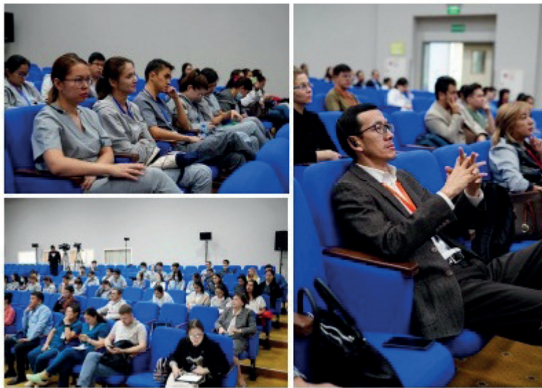
Figure 4. Overall 253 participants from 12 countries attended course offline and 150 – online

Overall 253 people participated in the offline format and 150 in the online format of the event – doctors from 12 countries: Kazakhstan, Austria, Hungary, Turkey, Poland, Russia, Latvia, Belorussia, Uzbekistan, Kyrgyzstan, Tajikistan and Georgia (Fig. 4).