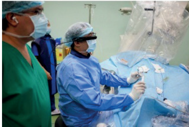
Figure3. Overall 16 patients with complex arrhythmias were operated during course