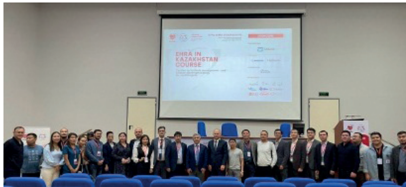
Figure 5. Organizers and faculty of EHRA course in Kazakhstan

Acknowledgement and funding: None to declare