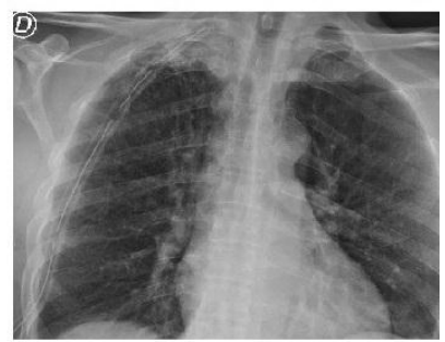
http://hvt-journal.com/articles/art546 DOI: 10.24969/hvt.2024.546

Key words: Pneumothorax, management, percutaneous drainage, needle aspiration, VATS, guidelines (Heart Vessels Transplant 2025; 9: doi: 10.24969/hvt.2024.546)