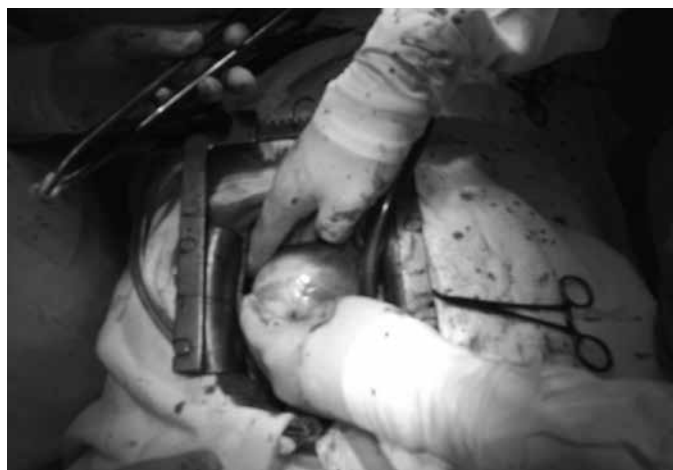
Figure 2. Intraoperative view of left ventricular hydatid cyst.

The postoperative period was uneventful. The following laboratory data were obtained: complete blood count - hemoglobin - 111 g/L, red blood cells count - 3.7 \times 10^6/L ;