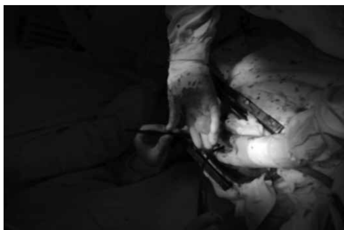
Figure 3. Intraoperative view of multiple hydatid cysts after removal from left posterior wall.