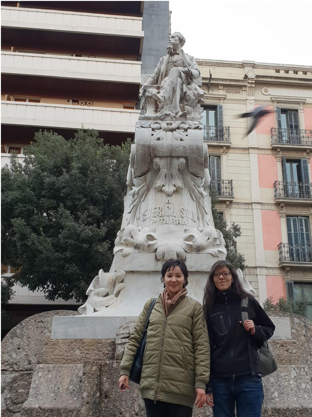
Figure 8. On leisure time, sightseeing in Barcelona