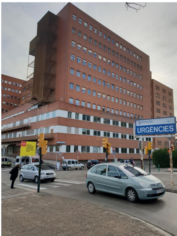
Figure 6. Hospital Josep Trueta, Girona.