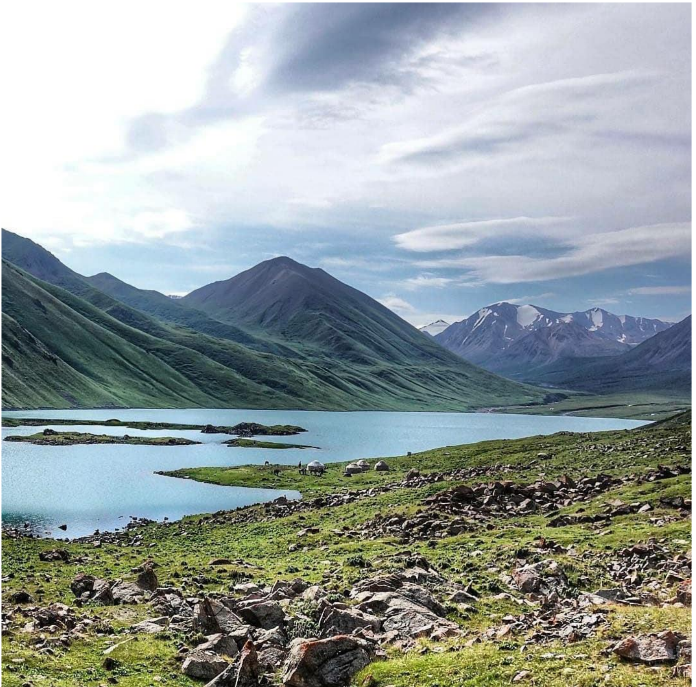
The lake in high-altitude Kochkor region, Naryn, Kyrgyzstan.