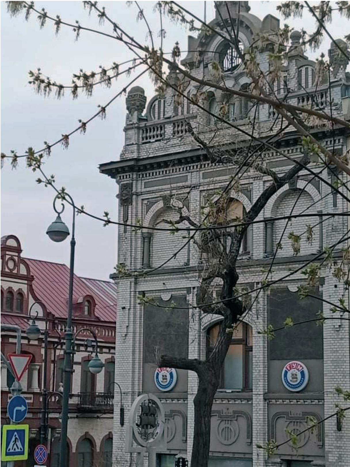
Kunst building, early 20 th century, Vladivostok, Russia.