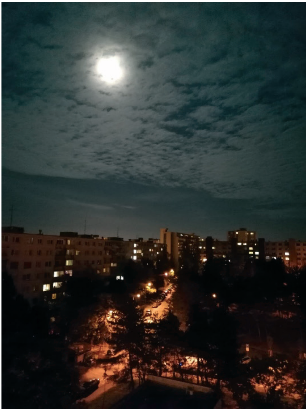
Night in Bratislava, October 2021. Ljuba Bacharova, Bratislava, Slovakia