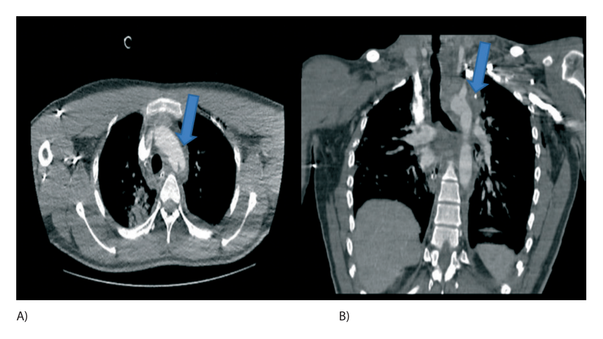
Figure 2. On contrast-enhanced computed tomography of the thorax (axial (a) and coronal (b) images), a complete rupture of the aortic arch at the level of the isthmus is observed (blue arrow).