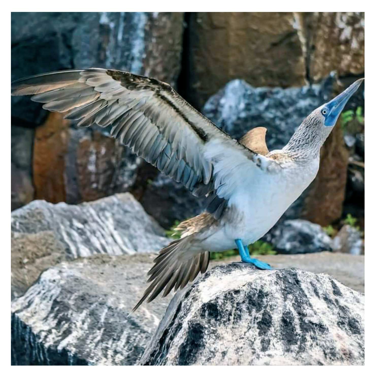
Blue-footed booby (Sula nebouxii), Galapagos Ireland, 2021. This smart bird is distinguished by blue foot due to a fish diet rich of carotenoids, it is an excellent divers and is called booby (Spanish bobo -foolish) because of the awkward walking (www.nationalgeographic.com, www.latin2travel.com). Anna Zelek, Washington, USA.