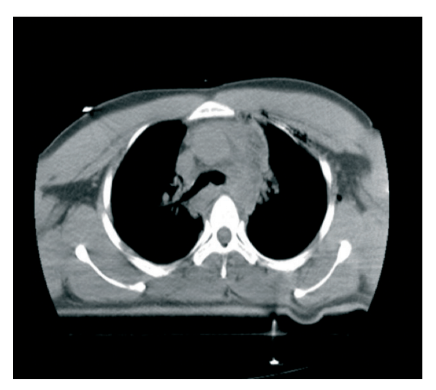
Figure 1. On non-contrast thorax computed tomography (axial images), a hematoma is observed in the mediastinum and around the aorta