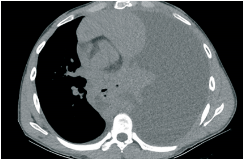
Figure 1. Computed tomography scan showing massive left pleural effusion with mediastinal shift and an anterior mediastinal mass

of mediastinal lymphoma. On arrival in the operating room (OR), the patient was prepared for the procedure according to the following scheme: pre-medication not given; chest drainage unclamped, radial artery line inserted, and ultrasound-guided erector spinae block with 7.5 Ropivacaine (10 mls). On induction, the patient had severe decrease in SO_2 (78%) and hypotension. The patient was given a stat dose of inotropes, and oxygen flow was increased. Then, after initial improvement, the anesthetist inserted a double-lumen orotracheal tube and the surgical procedure was carried out without difficulties. At the end of operation, however, the patient remained hypoxic, so that he could not be weaned from ventilator. A chest X-ray obtained in the ITU showed a diffuse opacification of the left lung, which was fully expanded (Fig. 2). The patient luckily improved over the subsequent 2 days. The final diagnosis was anaplastic lymphoma, and the patient started the treatment with a good initial response.