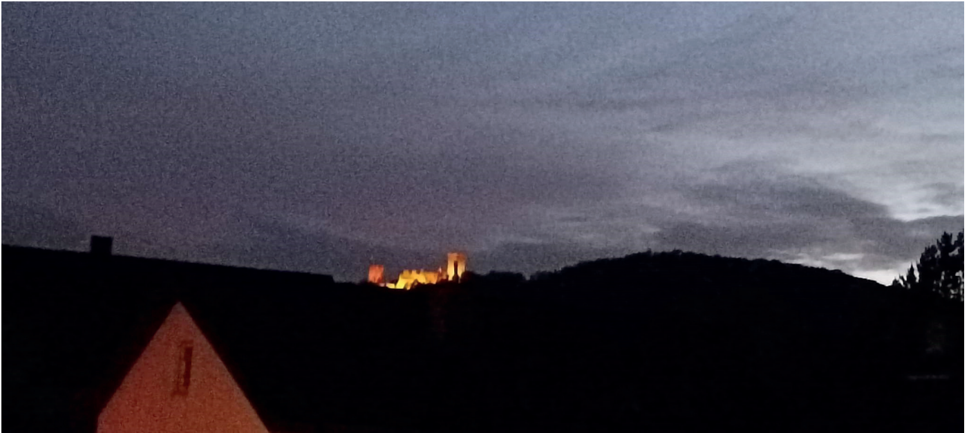
Rotteln Castle, popularly known as ``Rottler Castle`` is located in extreme south-west of Baden-Wurtemberg, in the border triangle of Switzerland, France and Germany. It is one of the most imposing medieval fortresses and the third castle ruin in the Baden. By Martha Klinckwort, Basel, Switzerland.