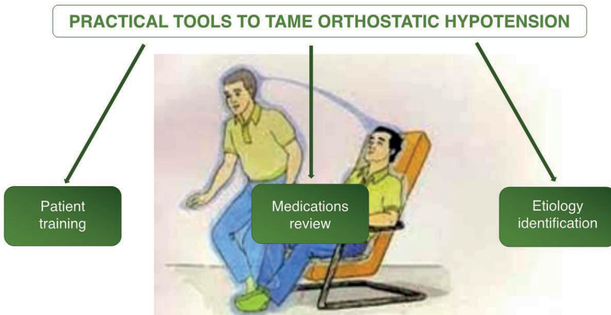
Figure 2. Practical tools to adopt when clinically approaching a case of orthostatic hypotension