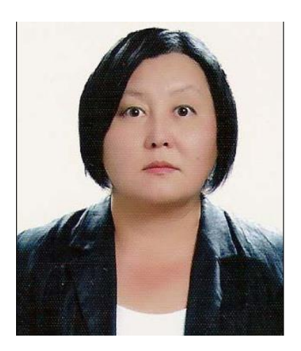
From Editor-in-chief: Our issue, journal's performance and indexing, new trials, guidelines and consensus documents, long COVID