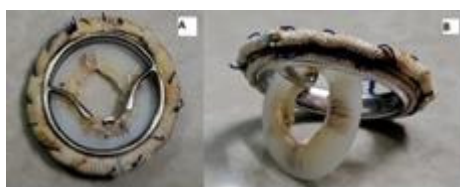
Figure 2. Case 2 (A) & (B) - photograph of explanted TTK CHITRA valve with a hole in the center of the disc