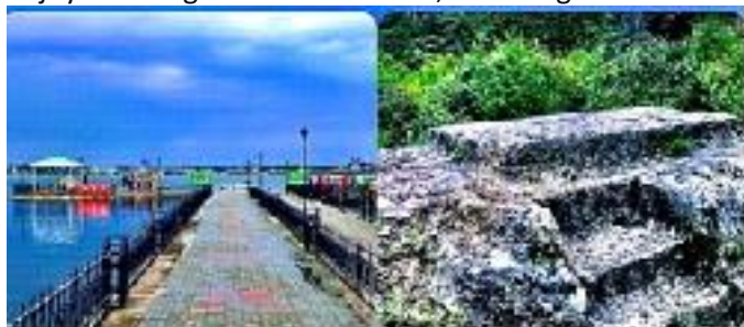
Figure 1. Takht-eBabri and Kallar Kahar Lake

Not really, an easy task, but a highly skilled car driver enjoys driving on such a road, which gives a travel