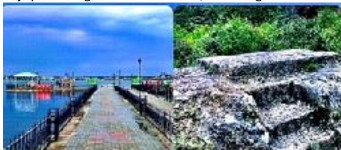
Figure 1. Takht-eBabri and Kallar Kahar Lake

Not really, an easy task, but a highly skilled car driver enjoys driving on such a road, which gives a travel