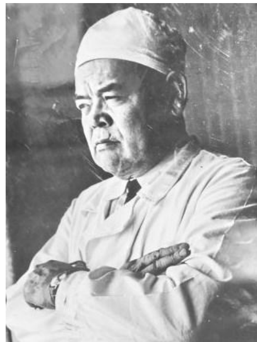
Figure 1. Academician Isa K. Akhunbaev

In the Kirghiz SSR, the formation of the new medical specialty has been connected with Academician I. K. Akhunbaev. On his initiative, the first group of anesthesiologists was organized in the department of thoracic surgery at the Republican Clinical Hospital in the capital Frunze (Now the capital Bishkek of the Kyrgyz Republic) of the Kirghiz SSR. Since then, a new specialty has emerged in the country. Figure 1 shows Academician Isa K. Akhunbaev.