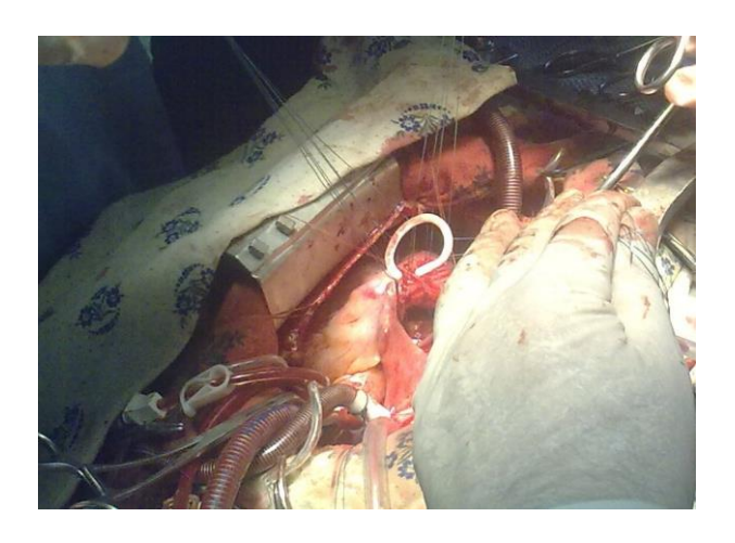
Figure 1. Intraoperative view of TV annuloplasty with support rings

this technique is used less frequently due to low efficacy compared to the method of De Vega (11, 12).