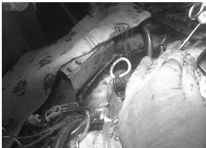
Figure 1. Intraoperative view of tricuspid valve annuloplasty with support rings

To prevent the development of some postoperative complications, one needs to navigate the surgical anatomy of the anterior-septal commissure, where the bundle of His is situated, to avoid development of a complete atrioventricular block. Also, lying sulcus coronaries extends right coronary artery trunk in the frontal cusp zone (3-4mm from FR) and commissures in the area of the side and caution should be applied not to damage coronary artery and cause complication like myocardial ischemia and infarction. The process of stitching on the fibrous ring of plastic is made with strict regard to the anatomy of the conduction system and the right coronary artery. Our patients did not have such complications in form of atrioventricular block or myocardial ischemia and infarction.